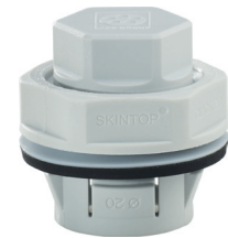
SKINTOP® CLICK BLK